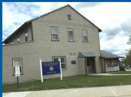
Navy-Marine Thrift Shop. Building 305 on the corner of Peary St and Meyerkord Ave, on Naval Station Newport