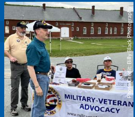
"Veterans Get Outside Day" at Ft. Adams, Newport hosted by Military Veterans Advocacy

Participants included Run Newport, the U.S. Navy Ceremonial and Brass Band, Project Opus (veteran song writing), List Academy of Music and Guitars for Vets, and elements from the Washington Tattoo with their Fife and Drum group and bagpipes. Event partners Sail Newport and Sail to Prevail provided free 30-minute sailing excursions for Veterans and their families. Military-Veterans Advocacy is a nonprofit corporation established to protect the rights of current and former members of the military. The organization focuses on education, legislation and litigation to ensure Veteran rights are protected and they receive the benefits they have earned and deserve.