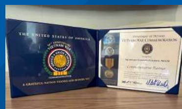
DoD Vietnam War Commemorative Partner Certificate presented to NCCNLUS