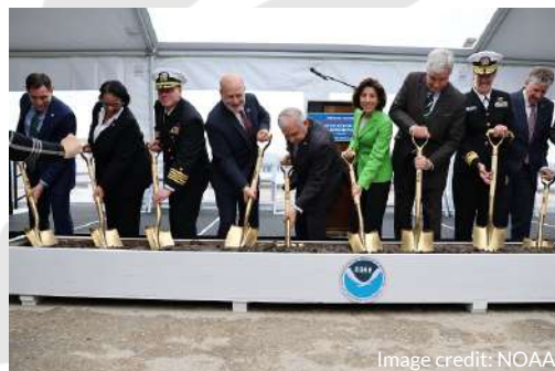
Ground Breaking ceremony for NOAA Marine Operations Center-Atlantic

NOAA ships are operated by NOAA’s Commissioned Officer Corps with 330 uniformed officers trained in engineering, earth sciences, oceanography, meteorology and fisheries science. They work alongside civilian professional mariners to collect data used to inform policies that protect marine mammals and ocean ecosystems, manage commercial fisheries, produce nautical charts that help keep mariners safe and understand climate change.