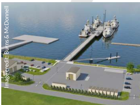
Image credit: Burns & McDonnell An illustration of the new NOAA marine operations center planned for Naval Station Newport

About $100 million for the project comes from the Inflation Reduction Act, the 2022 law that is investing in building a clean energy economy and strengthening energy security, Raimondo added before gold-painted shovels were passed out to dignitaries for the ground breaking on the 5-acre site surrounding Pier 2 which will be home to a new facility and pier that can accommodate four large vessels, a floating dock for smaller vessels, space for vessel repairs and parking plus a warehouse/ shore side support building. A total of 200 jobs will be assigned at the new and expanded facility.